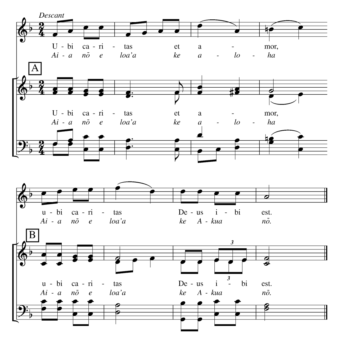
Translation: Where true charity and love abide, God is there.

Title: Ubi Caritas, et amor (Where true charity and love abide, God is there. Music: Malcolm Naea Chun Copyright: GIA Publications; Copyright: © 2003, ABC Music Co. Reprinted with permission under ONE LICENSE #A-737832. All rights reserved.