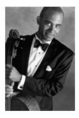
CLASSES: FREE OF CHARGE | CONCERT: $25 CENERAL ADMISSION PARISH HALL AND SANCTUARY AIR-CONDITIONED

MUSIC BY MENDELSSOHN, SAINT-SAËNS, AND BRAHMS INCLUDING "THE SWAN" FROM CARNIVAL OF ANIMALS