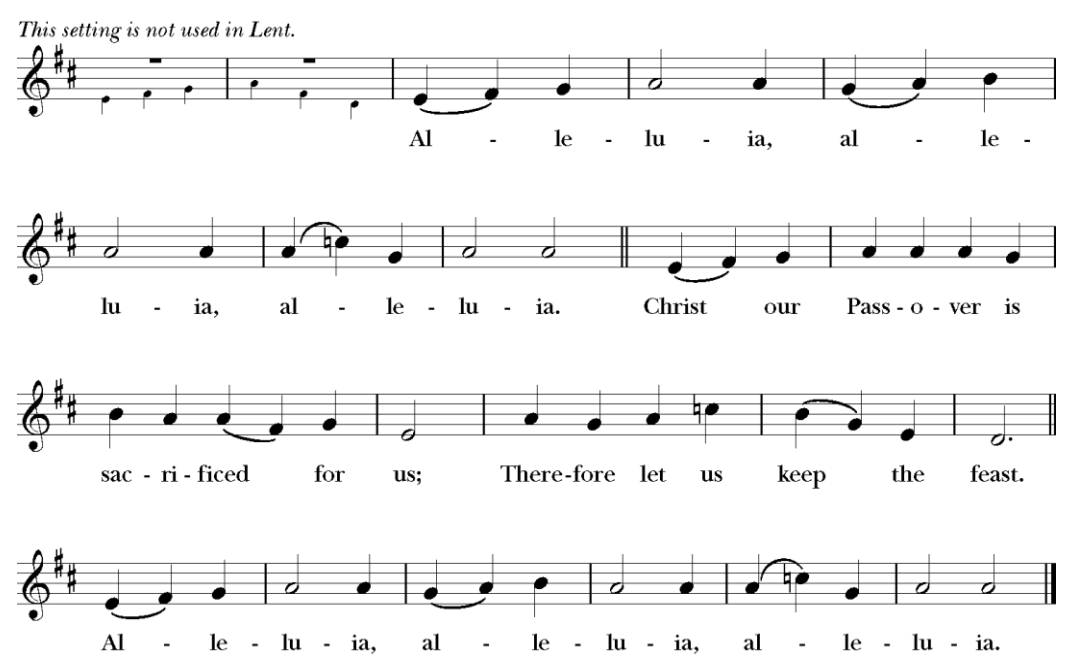
Title: The Holy Eucharist, Fraction Anthem: Christ our Passover Music: Gerald R. Near (b. 1942) Copyright © GIA Publications, Inc. Copyright: © 2003, ABC Music Co., All right reserved. Reprinted with permission under ONE LICENSE #A-737832. All rights reserved.