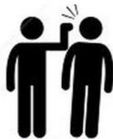
Interpersonal: acting out our racist beliefs and attitudes on others