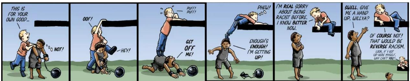
A CONCISE HISTORY OF BLACK-WHITE RELATIONS IN THE U.S.A.