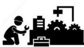
Institutional: the racist policies and practices of the institutions and organizations that determine our day to day realities