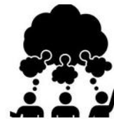
Ideological: the racist beliefs and values of our culture, reproduced by the media, schools, and the institutions that determine our day to day realities